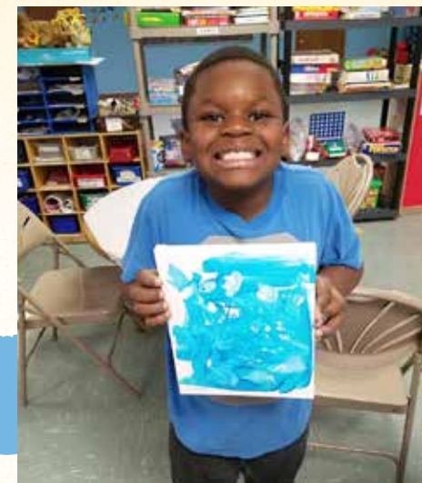
Paint nights were created as an opportunity for parents and children to connect in the classroom setting.